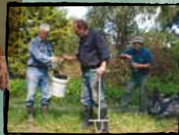
Apollo Bay Landscape Group

Interesting Fact: Breeding site for the small and shy Hooded Plover which is a vulnerable species in Victoria.