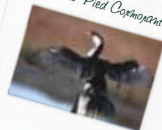
Little Pied Cormorant