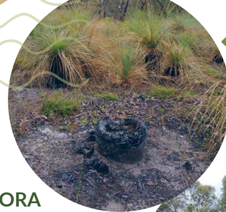
← Dieback devastation

Yellowing of grass trees is an early sign of Phytophthora dieback disease