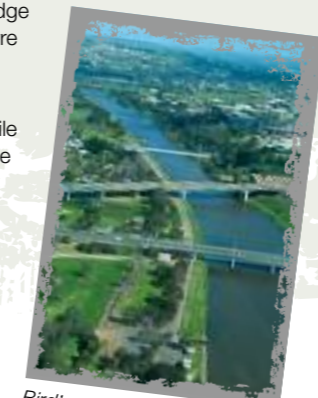
Bird's eye view of the Barwon

REFER INSERT BREAKWATER RD TO REEDY LAKE